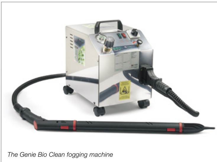
The Genie Bio Clean fogging machine