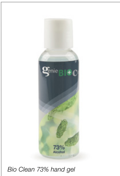
Bio Clean 73% hand gel