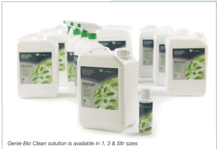
Genie Bio Clean solution is available in 1, 3 & 5ltr sizes