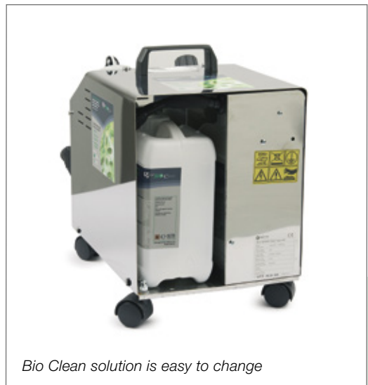
Bio Clean solution is easy to change